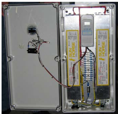
Optional Ballast Box

Note: Aqua Logic recommends that a qualified electrician to be call in to replace or change the electrical components on the UV unit.