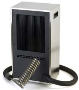
TLC Trimline Cyclone Drop- in coil water chillers -1/4 and 1/3 HP