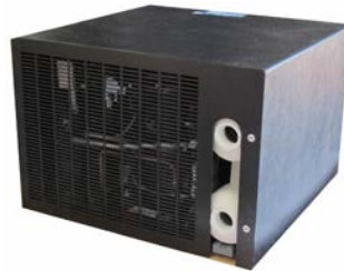
Delta-Star inline water chillers. -1/4 thru 1-1/2 HP