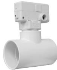
Safety water flow cutout switches 1" thru 3" pipe