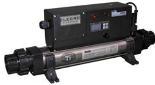
Inline Titanium heaters 1 kW thru 60 kW